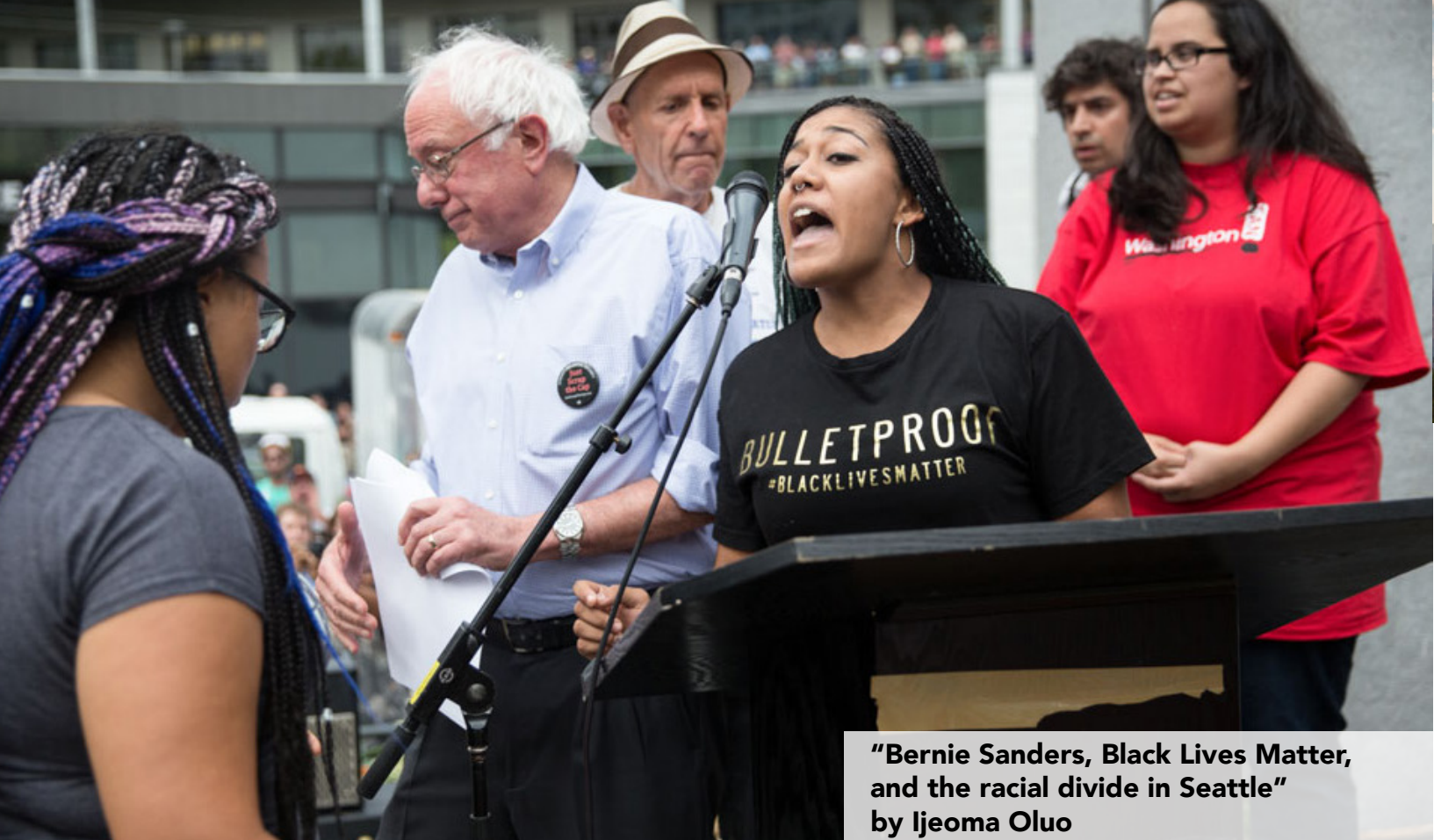
"Bernie Sanders, Black Lives Matter, and the racial divide in Seattle" by Ijeoma Oluo